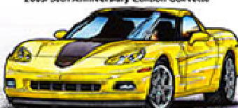
2008 Hertz Z12 Corvette