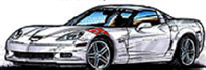
2007 Ron Fellows Z06 Special Edition Corvette