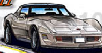
1982 Collector Edition Hatchback Corvette