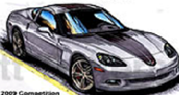
2009 Competition Edition Corvette