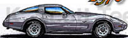
1978 Silver Anniversary Corvette