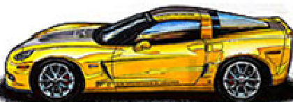
2009 GT1 Championship Edition Corvette