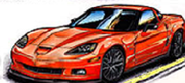
2011 Z06 Carbon Edition Corvette

Meetings: 8:00 p.m. 1 st Tuesday every month Frado's Italian Restaurant 535 Queenston Street St. Catharine's, Ontario.