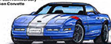
1996 Grand Sport Corvette