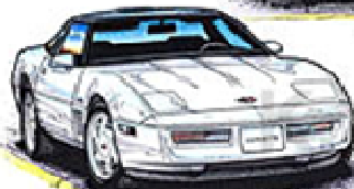
1988 35th Anniversary Edition Corvette