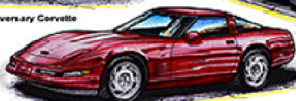
1993 40th Anniversary Package Corvette "Ruby Red"