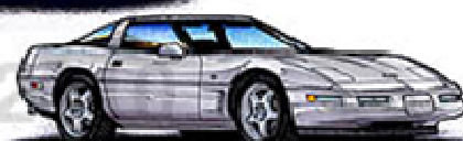
1996 Collector Edition Corvette