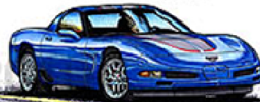
2004 Commemorative Edition Corvette