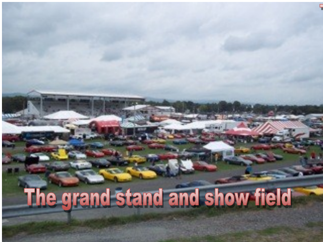
The black corvette is the Coney Island Corvette. The theme this year was barn finds and it turns out that this corvette spent many years under a roller coaster at Coney Island.