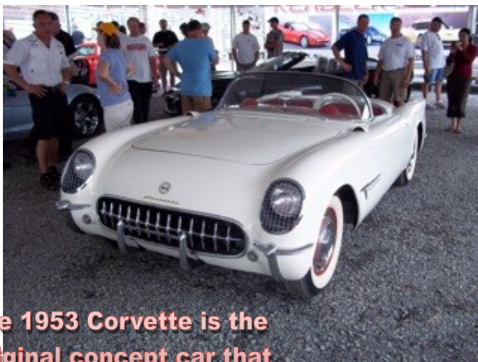
The 1953 Corvette is the original concept car that was showing at the Motorama show in 1953