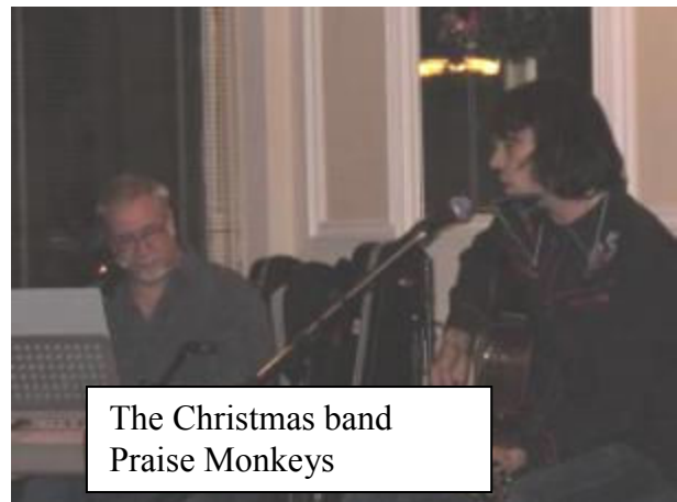
The Christmas band Praise Monkeys

Bowling: Saturday March 7 th , Cataract Bowl on Lundy's Lane. Be there for 3:30 Cost to club $8.25 includes 2 games of 10 pin and shoe rental. 15 bowlers needed to get this price.